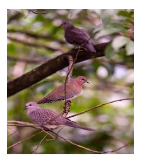
Fig.2: Photographic record of Laughing Dove (middle position) in Singhik Reserved Forest of the Sikkim Himalayas.

The Internet IBC Bird Collection 2019. https://www.hbw.com/ibc/species/laughing-dove spilopelia-senegalensis. Accessed on: 2019–08–16.