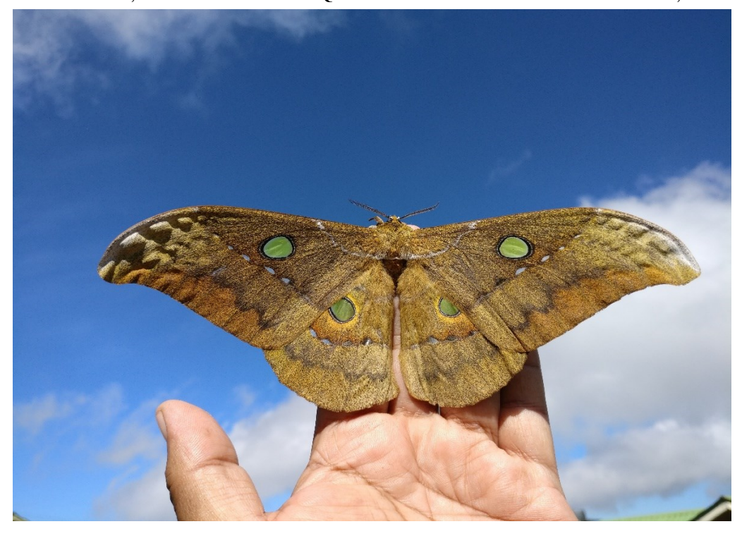
Date of Publication: 28th December, 2019