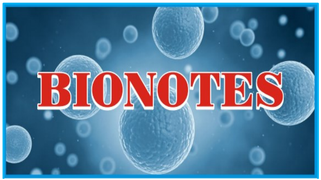
VOLUME 21, NO. 4